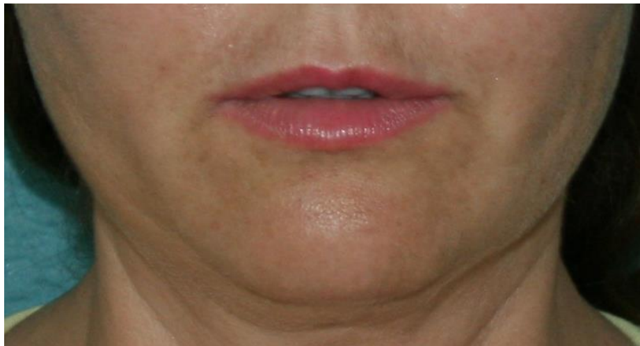
After one treatment with Sagoni+ 3 treatments RRS Cellutrix