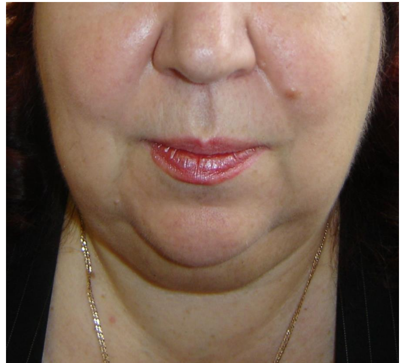
After 6 treatments