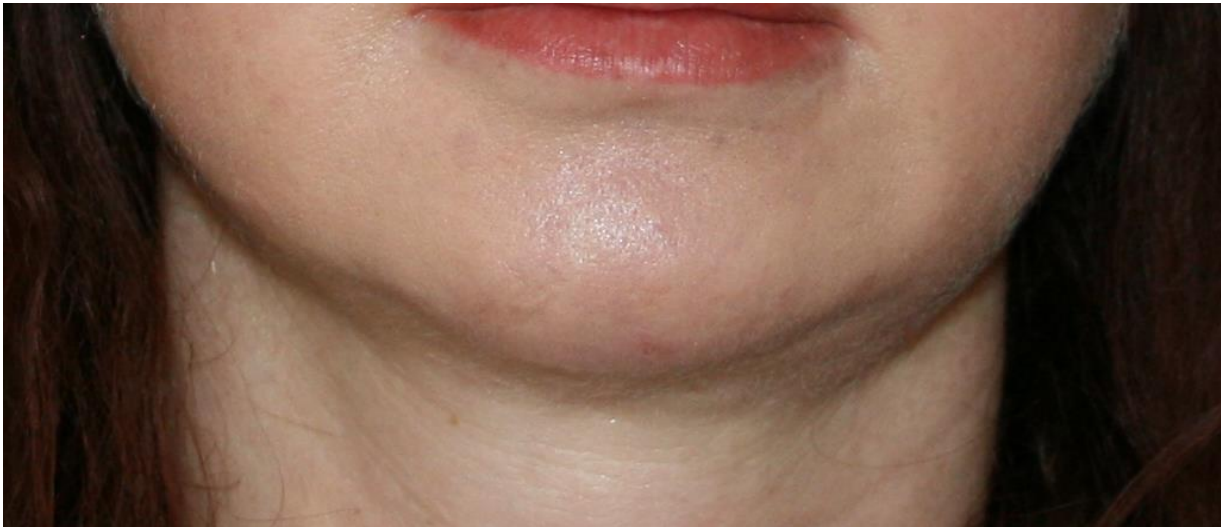
After Sagoni One treatment