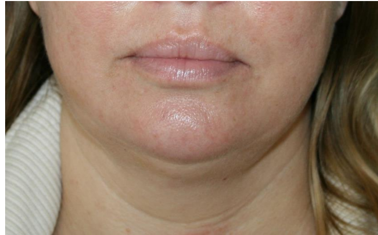
After Sagoni 3 sessions, 3 months