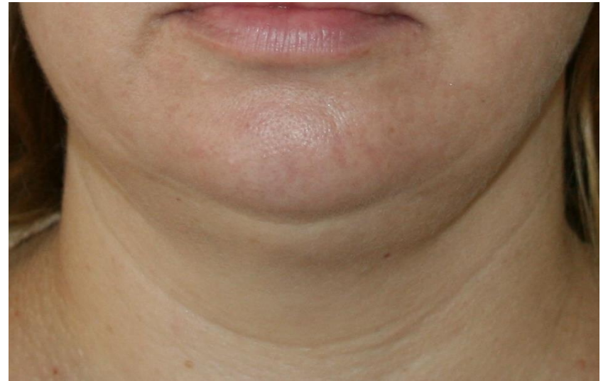
After 3 sessions of Sagoni , 2, 5 months