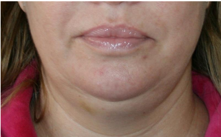
One week after first treatment with Sagoni