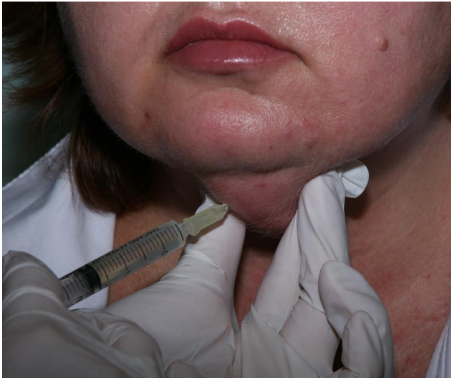
Treatment 2 step